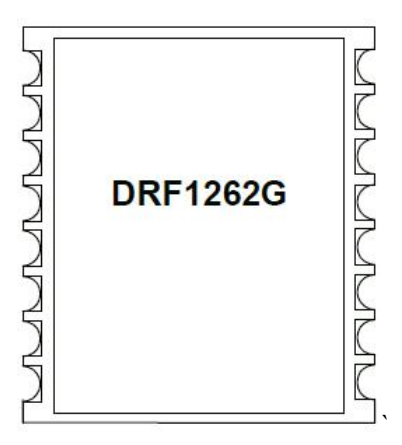
Figure 1: DRF1262G Pin Layout